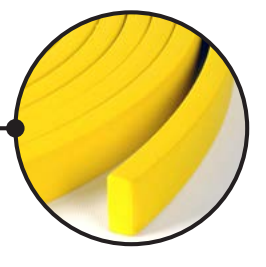
PRONIL ACR-300 Hydrophilic Waterstop